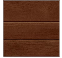
Medium Oak Plank