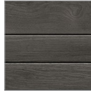
Carbon Oak Plank