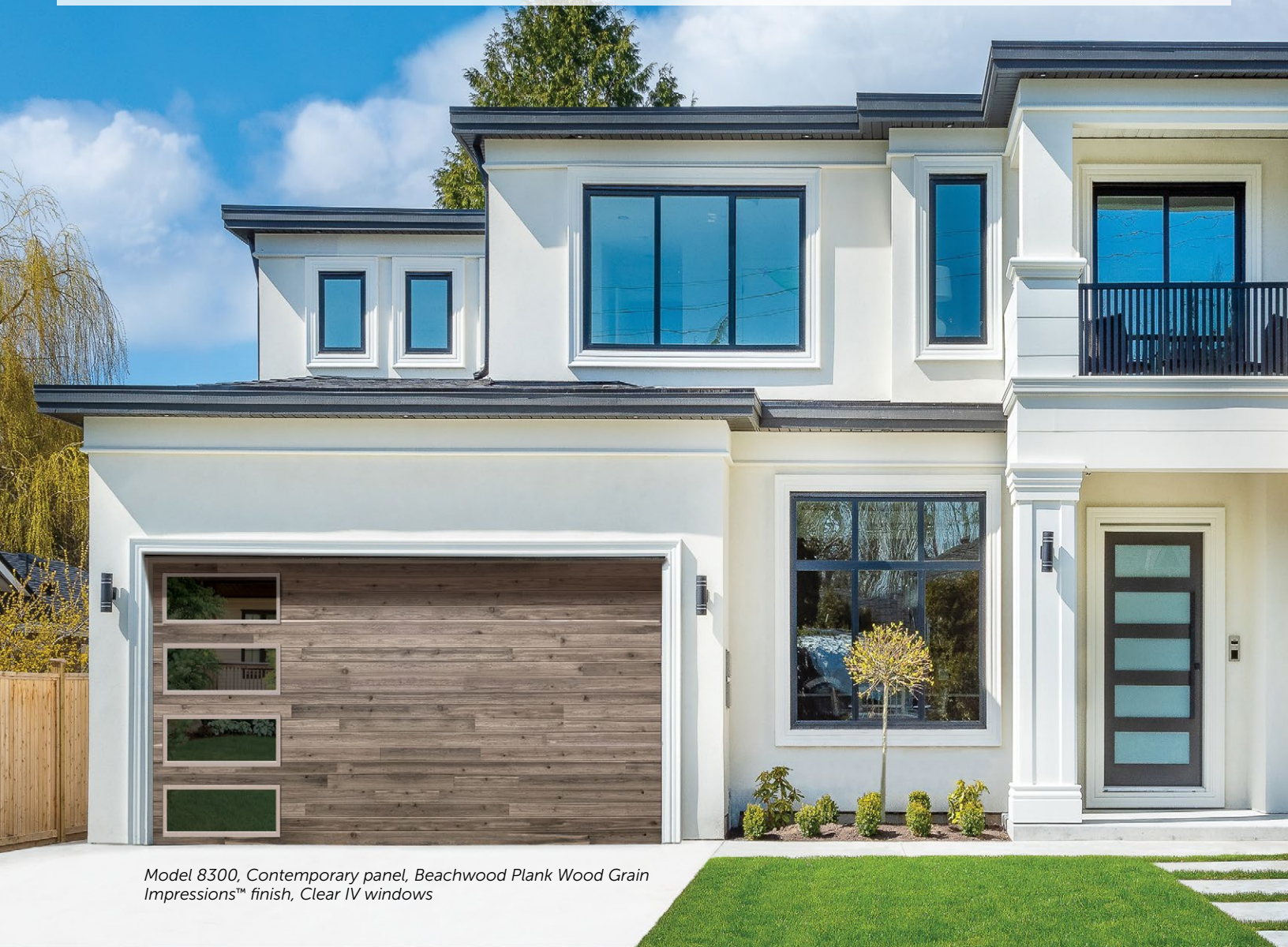
Model 8300, Contemporary panel, Beachwood Plank Wood Grain Impressions™ finish, Clear IV windows

Transform your garage with the authentic and captivating appearance of wood through a high-quality, digitally printed non-repeating grain on a robust steel garage door. This innovative design seamlessly blends the strength and durability of steel with the timeless beauty and charm of wood, resulting in a stunning and reliable option for enhancing the aesthetics of your garage.