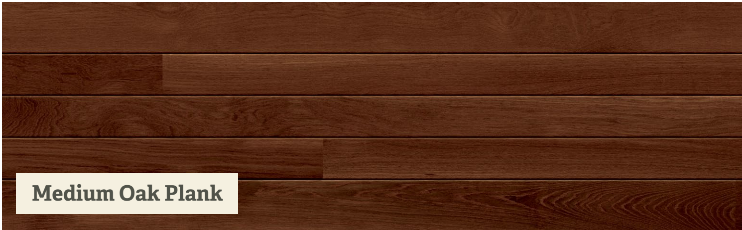
Medium Oak Plank