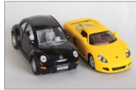
Gray Tinted Tempered