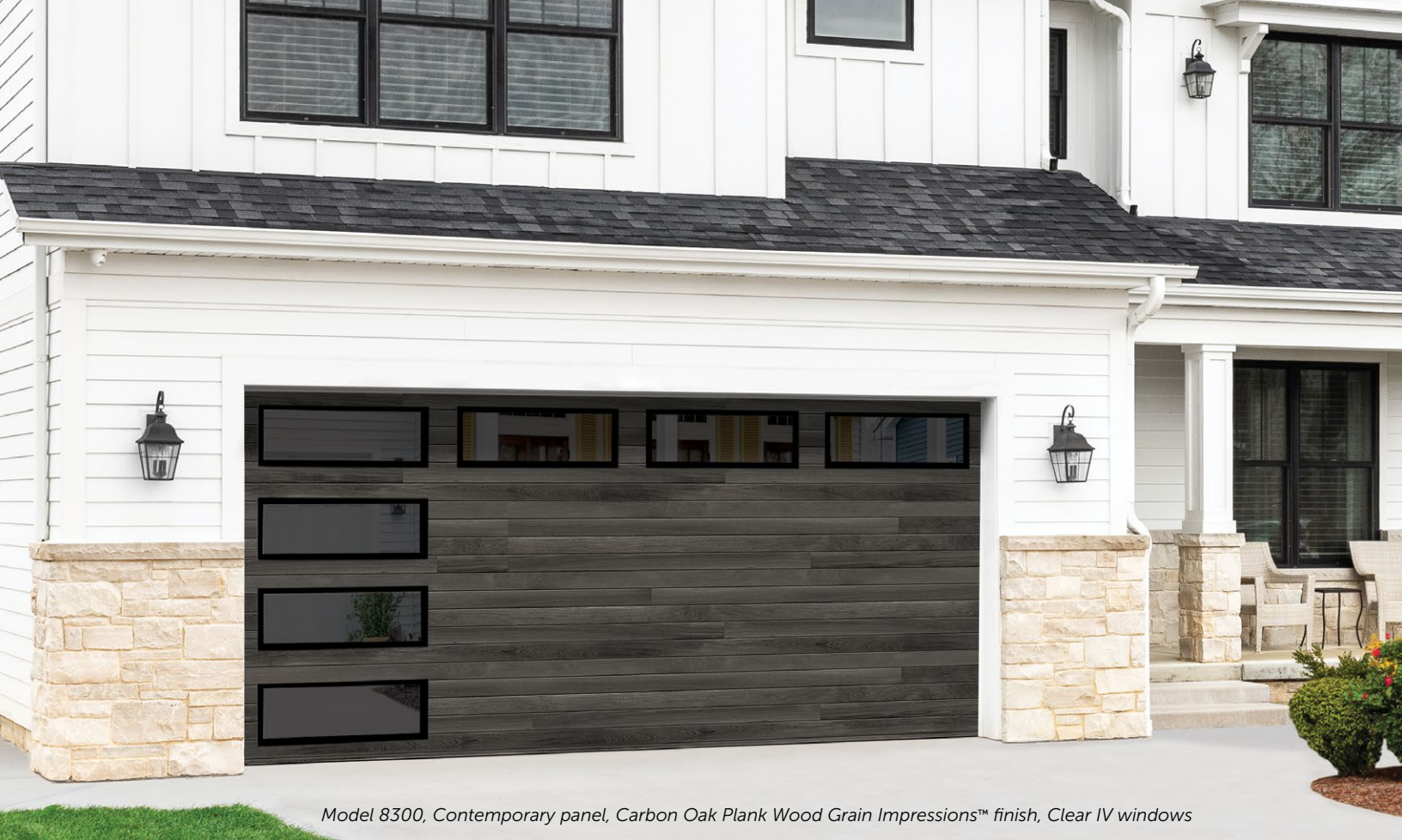
Model 8300, Contemporary panel, Carbon Oak Plank Wood Grain Impressions™ finish, Clear IV windows