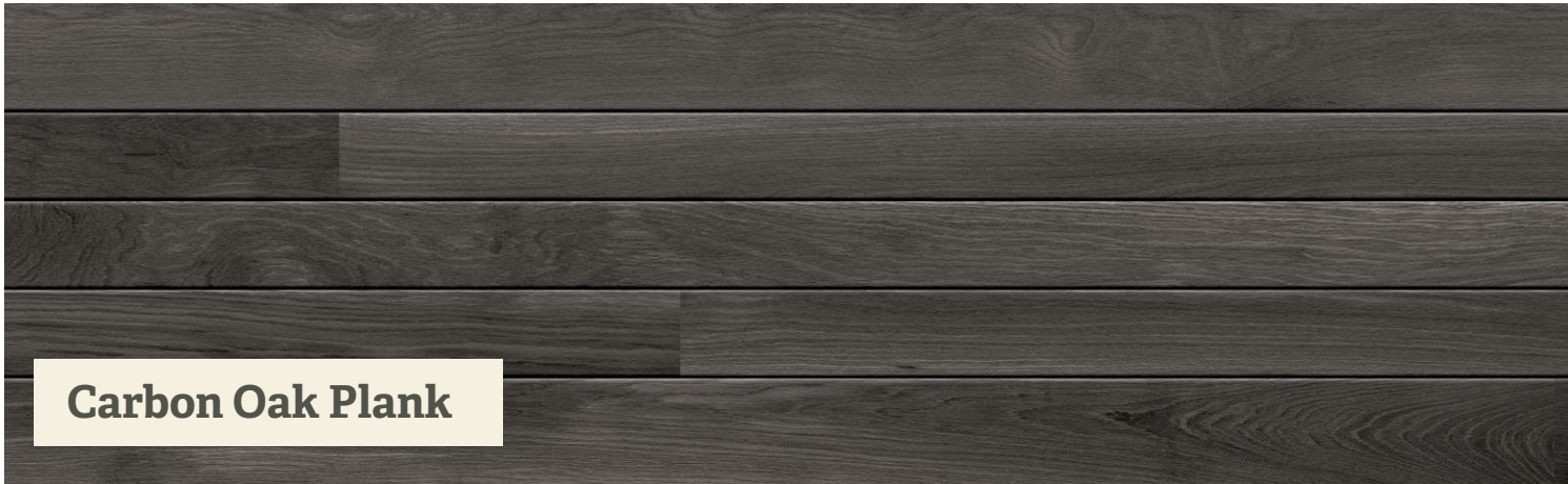
Carbon Oak Plank