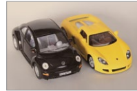
Bronze Tinted Tempered