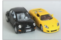
Green Tinted Tempered