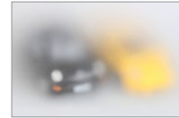
Satin Etched Privacy†