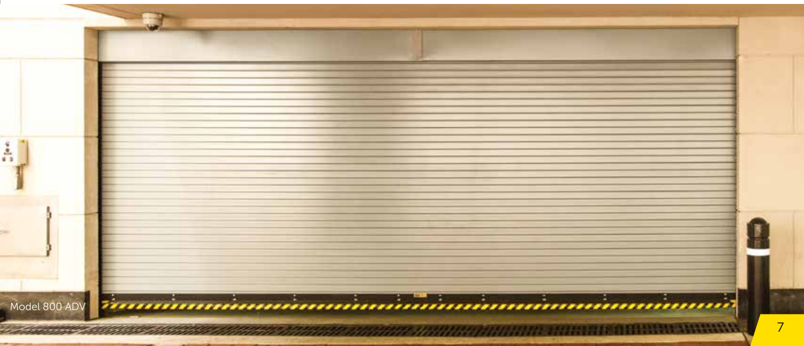
Model 800 ADV

You'll find Wayne Dalton in the manufacturer directory at SWEETS.com. Our full specifications and CAD files are available on the SWEETS website.