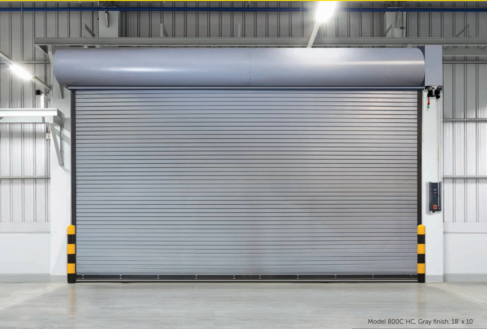
Model 800C HC, Gray finish, 18' x 10'