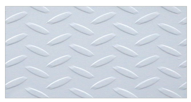
Proprietary textured powder coat finish