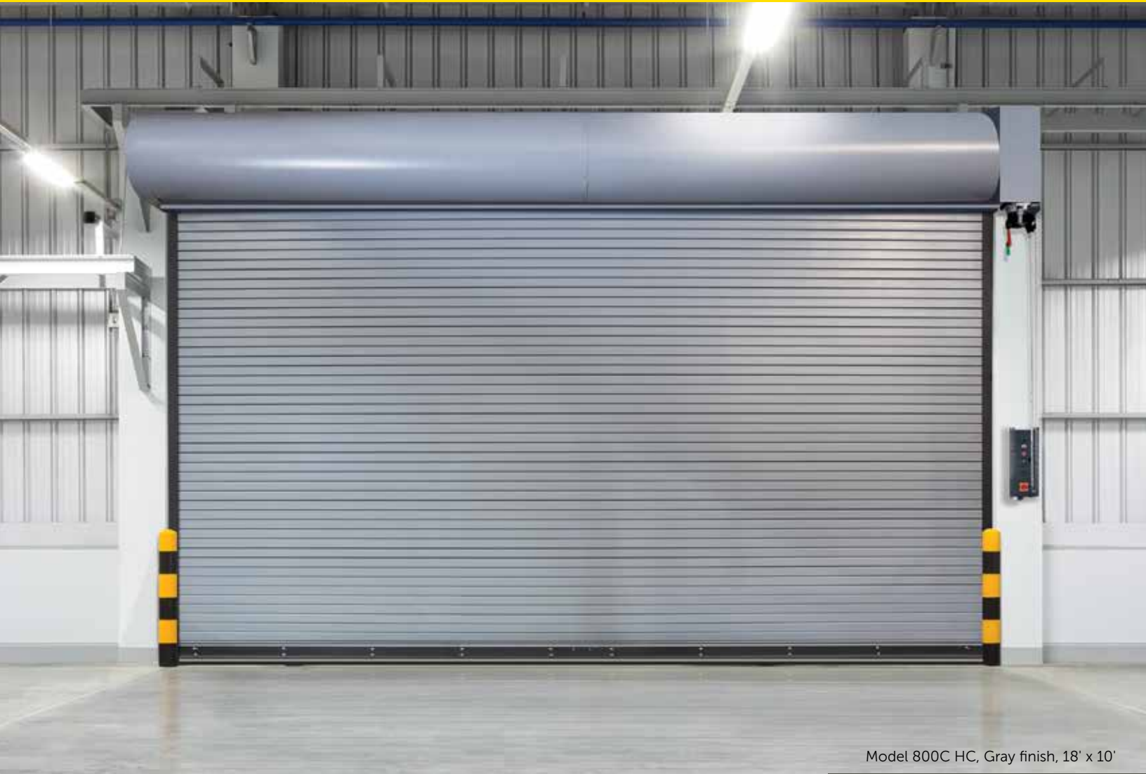
Model 800C HC, Gray finish, 18' x 10'