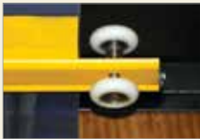
Wind strut with roller windlock

*Wind load is the ultimate pressure tested at door width of 20'.